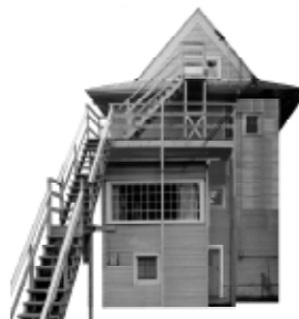
1122 Comox St. South Existing