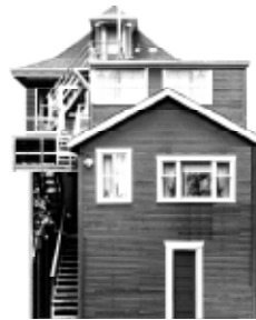
1120 Comox St. South Existing

The Society formed the friends of Mole Hill , an unprecedented citywide coalition of neighbourhood, church, union, service and advocacy organizations. Through their combined hard work the support of over six thousand Vancouver residents from communities throughout the city were enlisted to assist in the recognition, preservation and grassroots enhancement of this valuable housing resource and important piece of Vancouver's heritage. In 1996 the Society was awarded a City of Vancouver Heritage Award for their advocacy on behalf of Mole Hill.