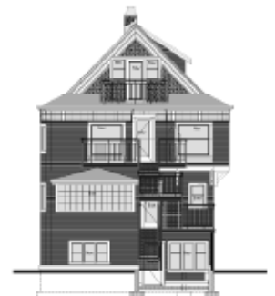
1122 Comox St. South Proposed