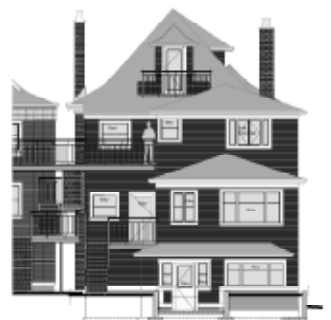
1114 Comox St. Proposed