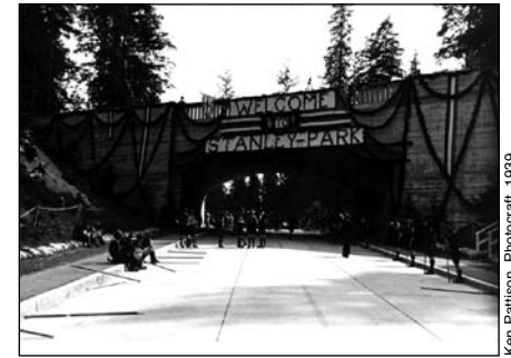
Prospect Point Bridge decorated for the Royal visit of 1939.