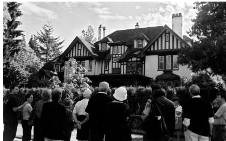
Admiring the 1929 Tudor Revival style Fleck House, 1296 The Crescent

Vancouver's Mayor Philip Owen took heritage enthusiasts for a walking tour of the estate like area of Shaughnessy on Saturday, September 22nd.