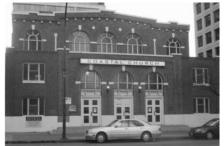
First Church of Christ, Scientist

Built in 1918, this has been the First Church of Christ, Scientist since its construction. The design is Second Renaissance Revival and the interior is an intact music hall, with